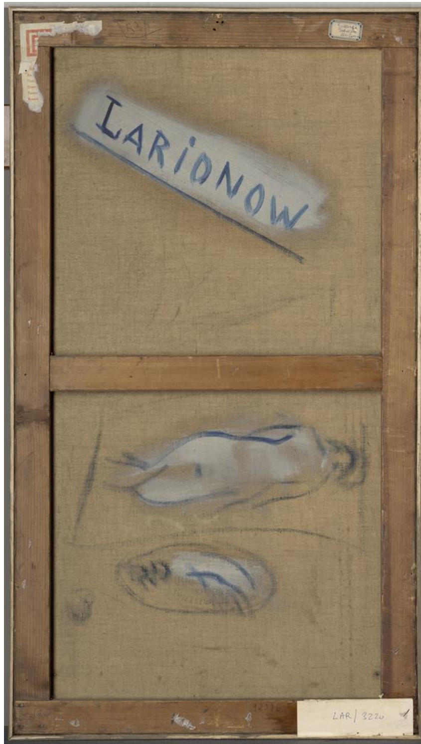
Plate 1. Mikhail Larionov, Still Life with Coffee Pot, c. 1906, collection Museum Ludwig: Inv. Nr. ML 1486. Verso, visible light.